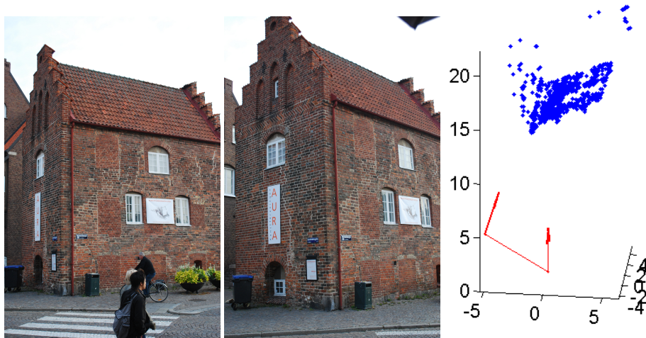
Figure 1: The images house1.jpg and house2.jpg and the 3D points.

Use RANSAC to robustly fit a plane to the 3D points X . If a 3D point is an inlier when its distance to the plane is less than 0.1, how many inliers do you get? Compute the RMS distance between the plane obtained with RANSAC and the distance to the 3D points. Is there any improvement? Plot the absolute distances between the plane and the points in a histogram with 100 bins.